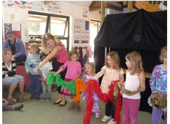
This was no ordinary puppet show and the children had to get involved in the production!

On Tuesday the Oakwood children were treated to a spectacular puppet show on the Soccer World Cup.