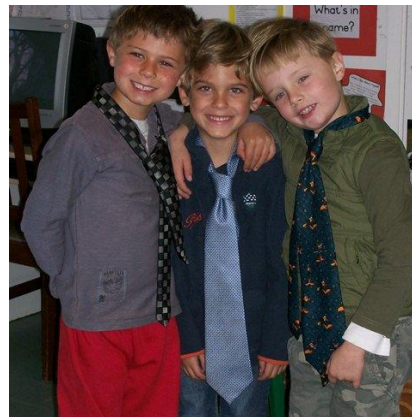
The Girls in Squirrel Class (Grade 0) love their teddies and the boys look ever so handsome in their ties!