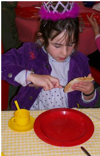
Buttering toast is tricky...