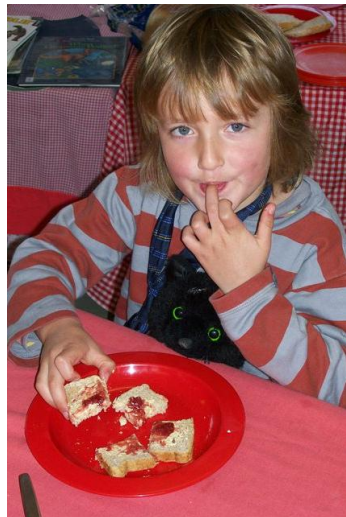
... fingers need a lick...